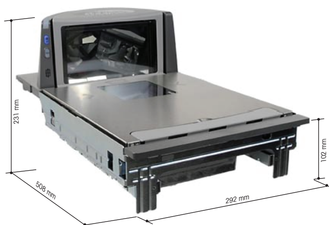
Datalogic 8300/8400 Long Scanner/Scale