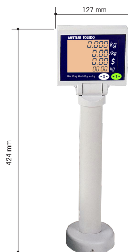
Price Computing Display