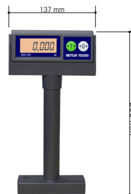
Weight Only Display