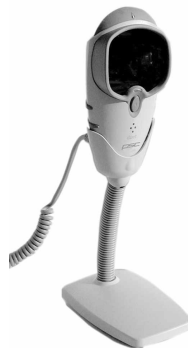
Accessory mount also available.