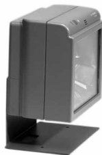
P/N: 7-0149 Riser