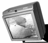
P/N: 7-0129 Wall Tilt