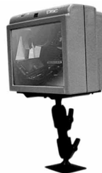
P/N: 7-0163 Panavise