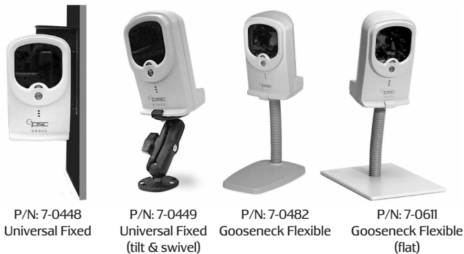
P/N: 7-0448 Universal Fixed